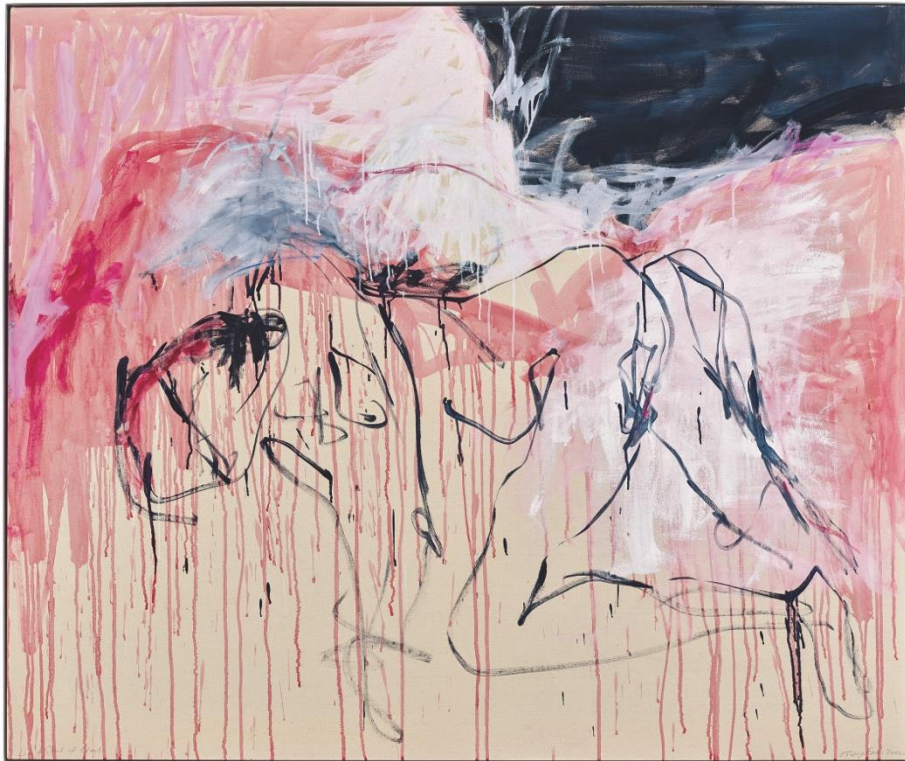
Tracey Emin, Like a Cloud of Blood (2022, estimate: £500,000-700,000)

20 TH / 21 ST CENTURY: LONDON EVENING SALE 13 OCTOBER 2022